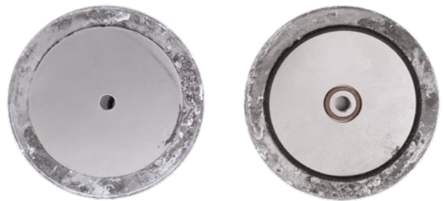
Fig. 4: Die-cast test specimen made from aluminum alloy AlSi12 (Fe) without AntiCorr® coating (after 720-hour salt-spray test as per DIN ISO 9227)

Figure 4 shows traces of corrosion on the entire seal face and subsurface migration beneath the peroxide-crosslinked EPDM seal insert. The test specimen in Figure 5 from the same test series shows no signs of corrosion on the seal face due to the AntiCorr® coating.