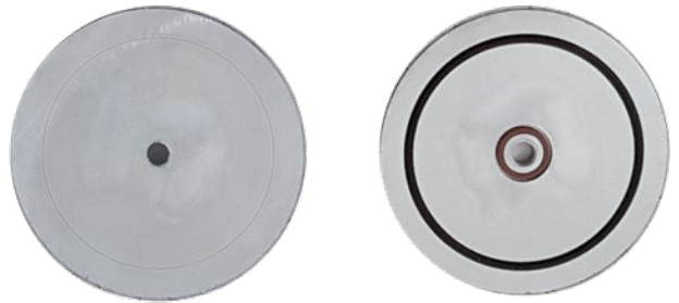
Fig.5: Die-cast test specimen made from aluminum alloy AlSi12 (Fe) with AntiCorr® coating (after 720-hour salt-spray test as per DIN ISO 9227)

Plasmatreat has extensive experience of industrial applications, the development of plasma-polymer coatings and their application with patented Openair-Plasma® technology.