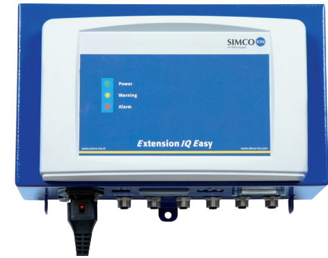
Easy cable acces