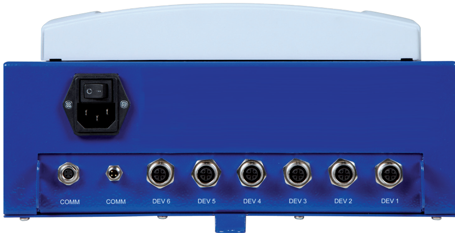
Connection of up to 6 devices